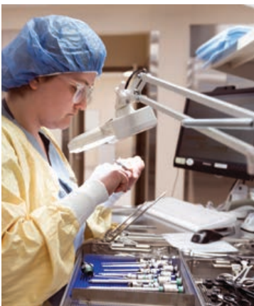
An MDR tech checks surgical equipment.